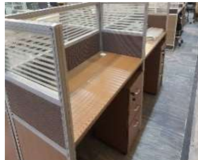
Work Station (Ser-5)