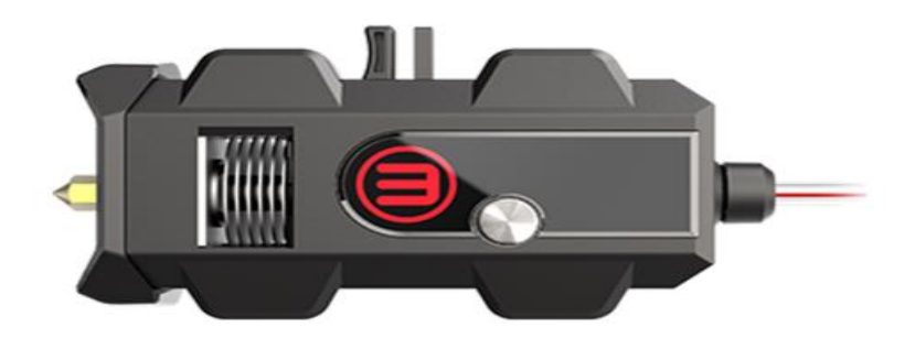
Figure 1: Only for reference purpose (Better model will be acceptable)